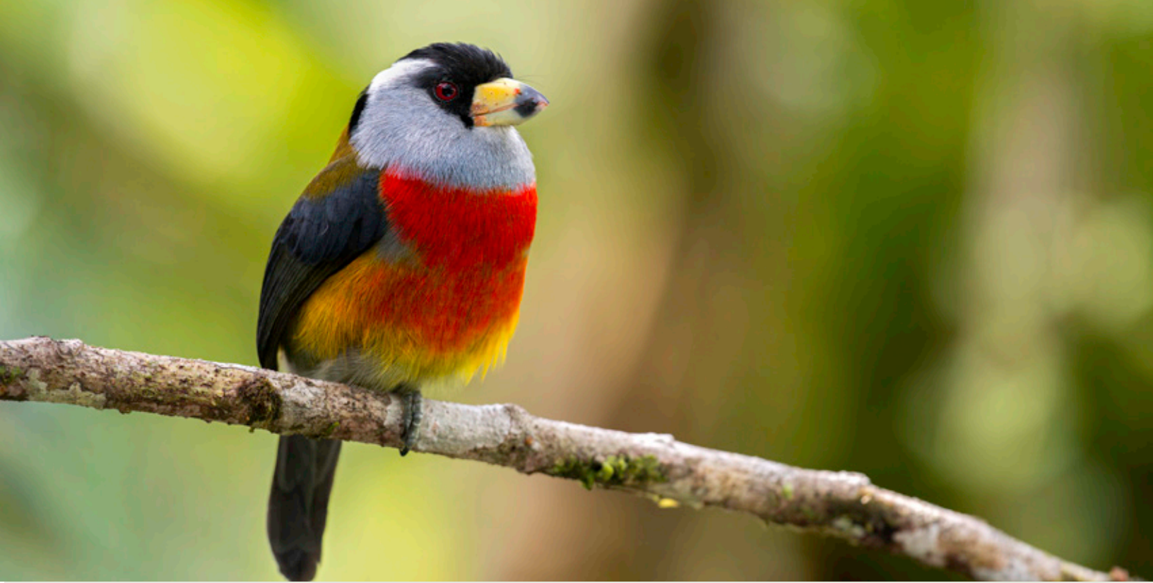
Toucan Barbet