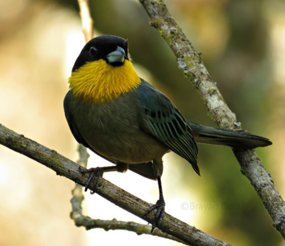
Yellow-throated Tanager Brayan Coral