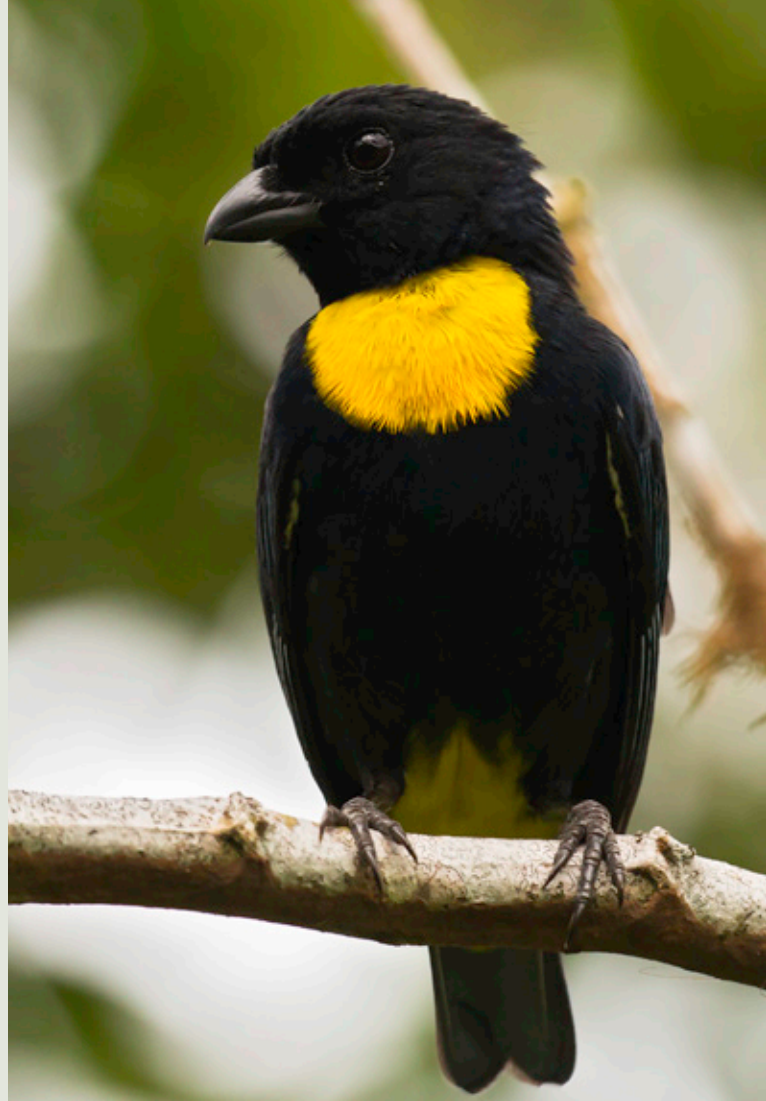
Golden-chested Tanager