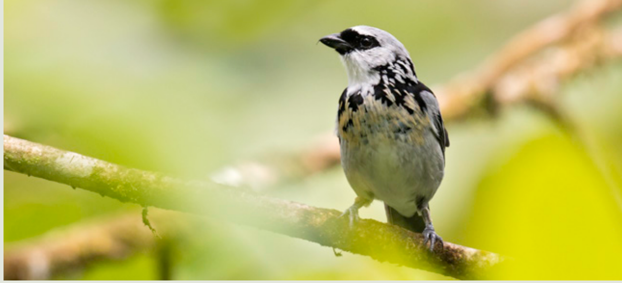
Gray-and-gold Tanager