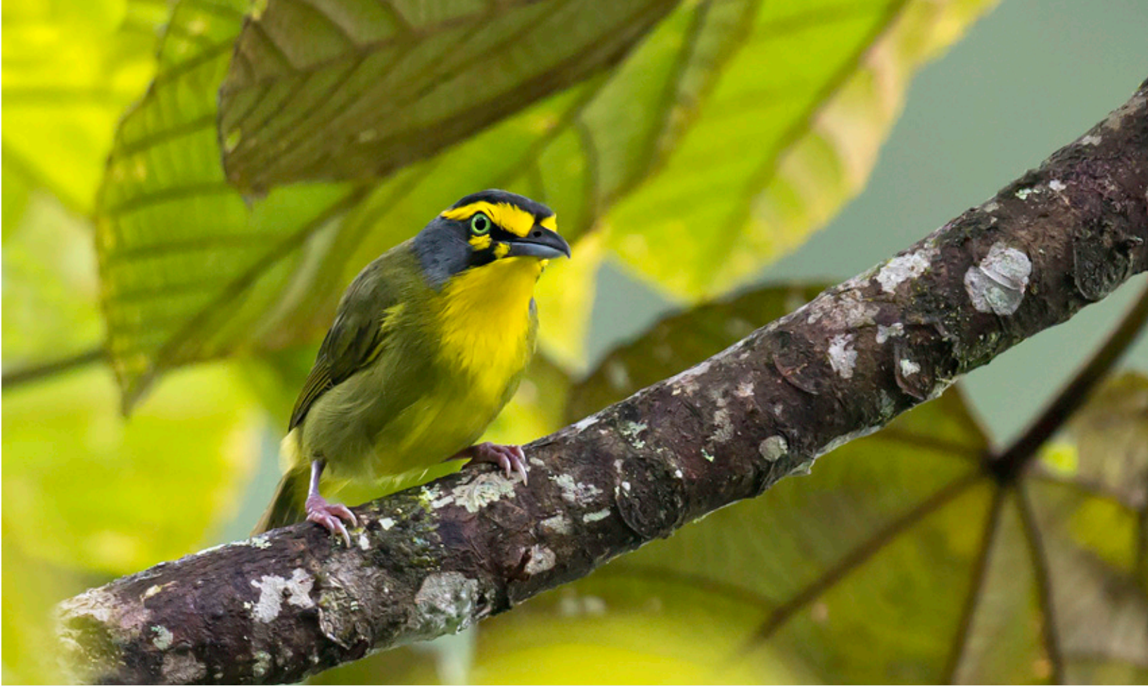
Slaty-capped Shrike-vireo