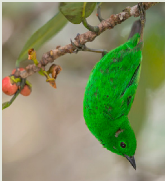
Glistening-green Tanager