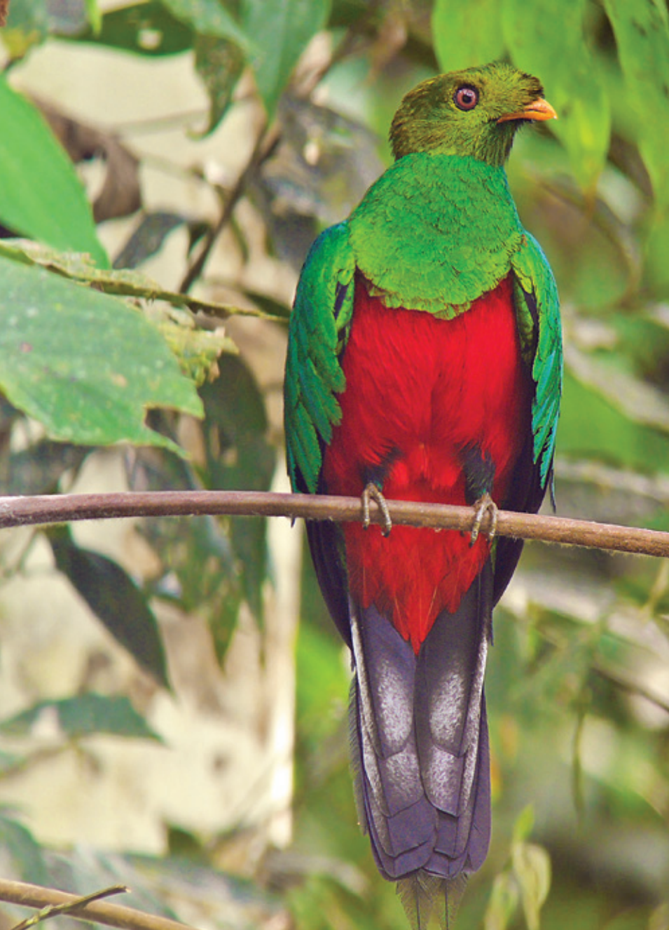
Crested Quetzal Christopher Calonje