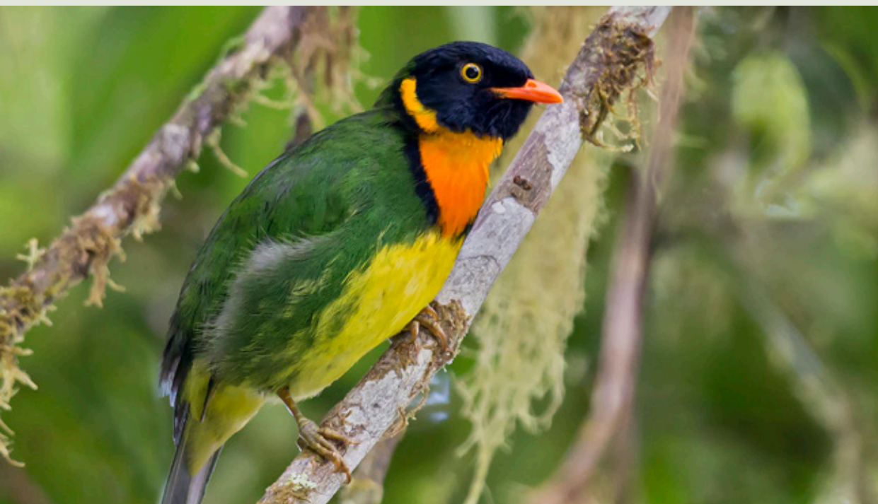
Orange-breasted Fruiteater