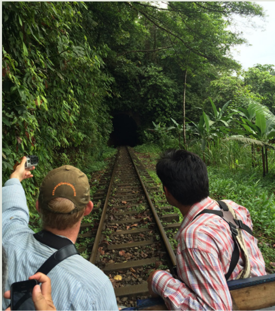
Brujitas in San Cipriano