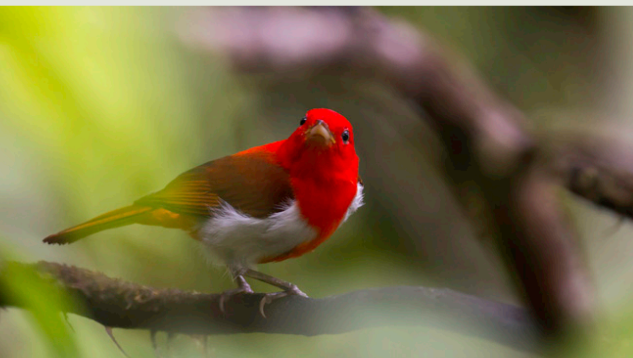
Scarlet-and-white Tanager