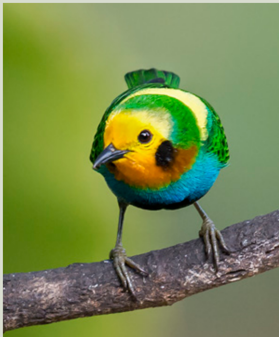
Multicolored Tanager