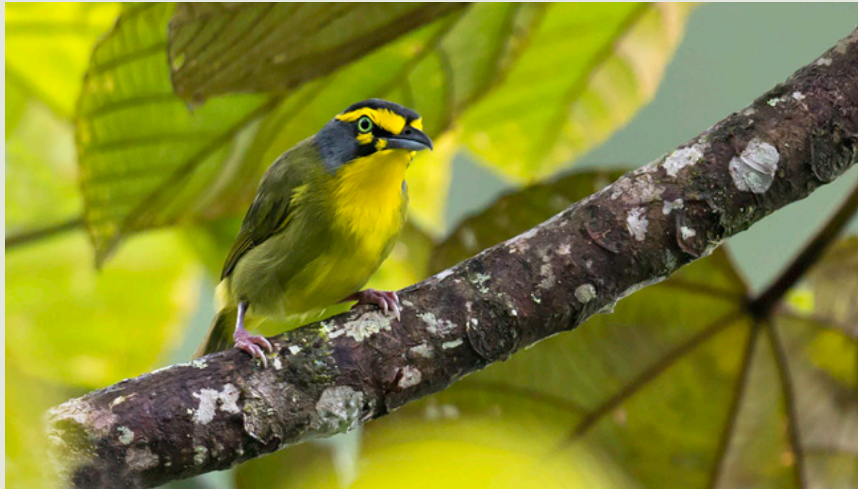
Slaty-capped Shrike-vireo