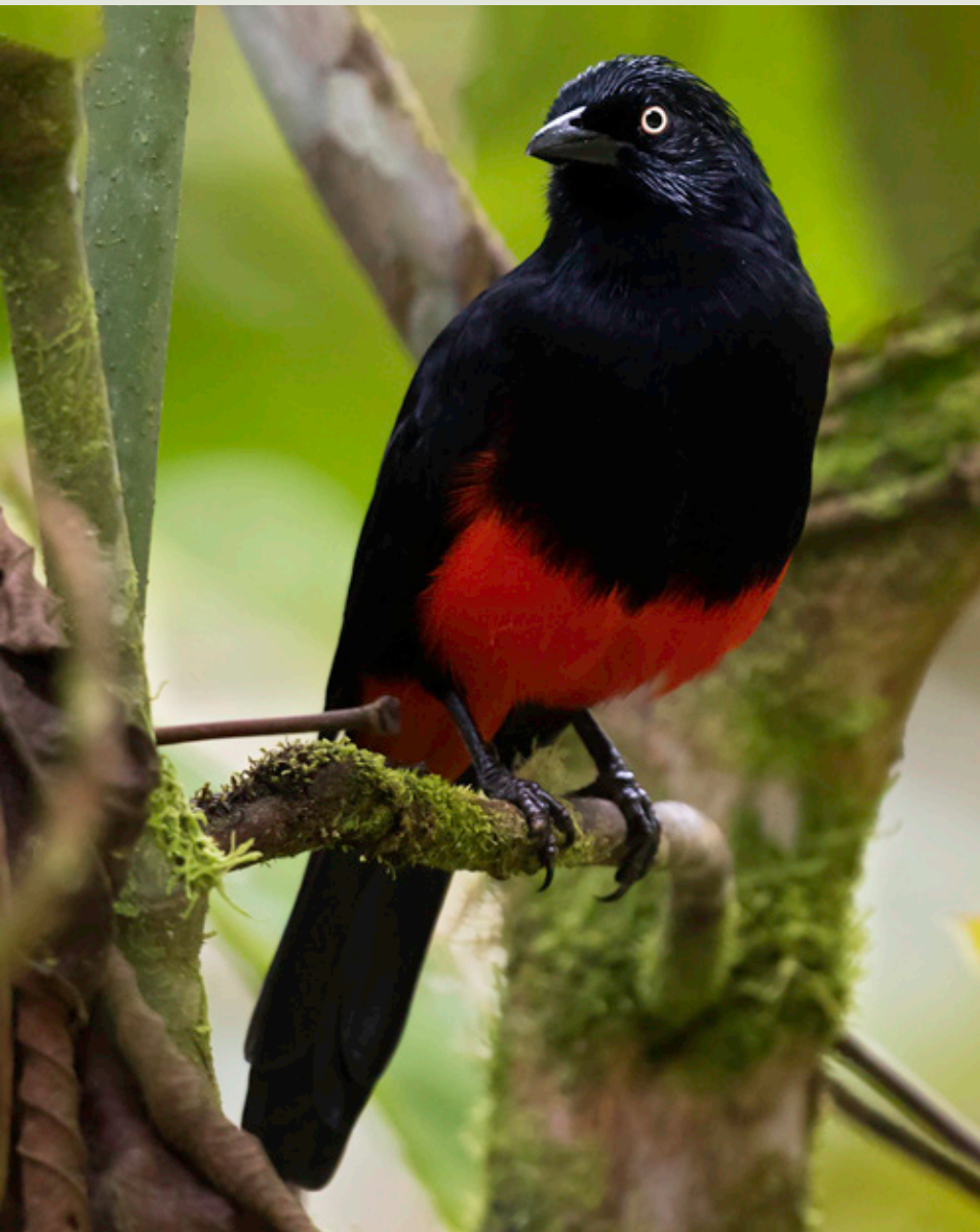
Red-bellied Grackle

After lunch we will begin ascending towards the Old Besuaco road for species such as Carunculated Caracara, Barred Anthrush, White-crested Elaenia, Red-hooded Tanager, Tufted Tit-tyrant, and White-banded Tyrannulet. We will arrive at the La Cocha Lagoon in time to settle in to our hotel, a cozy, Swiss-built hotel with fireplaces and spectacular views of the lagoon.