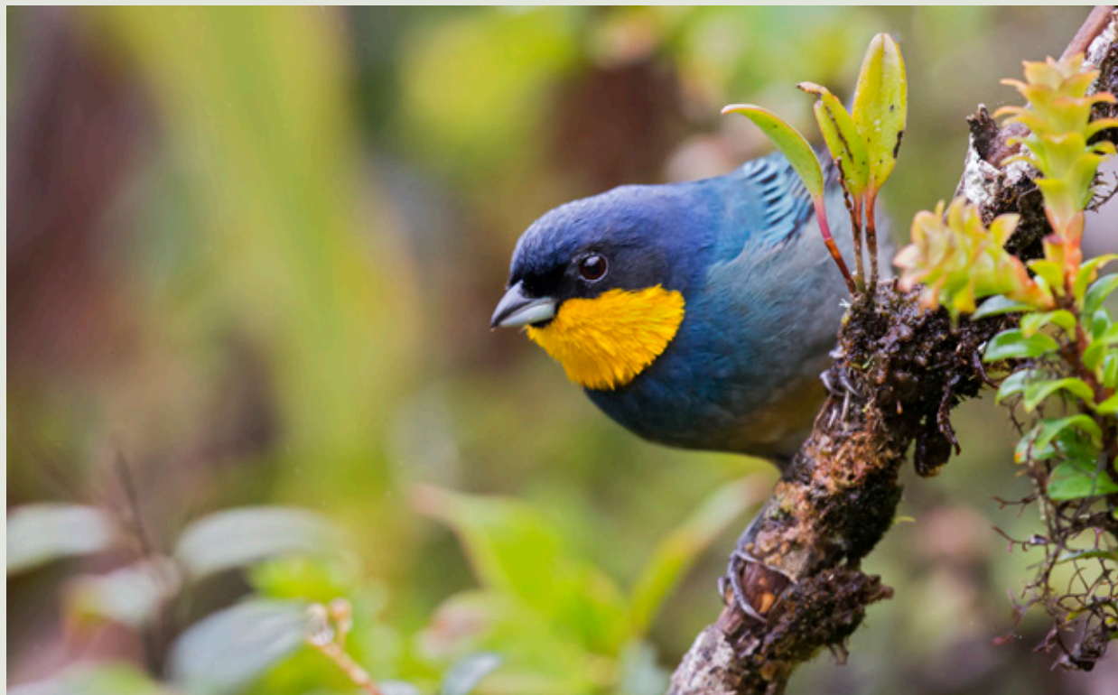
Purplish-mantled Tanager