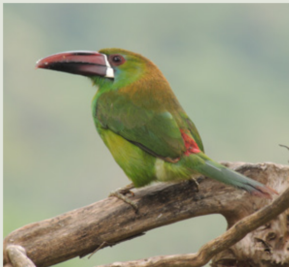
Crimson-rumped Toucanet