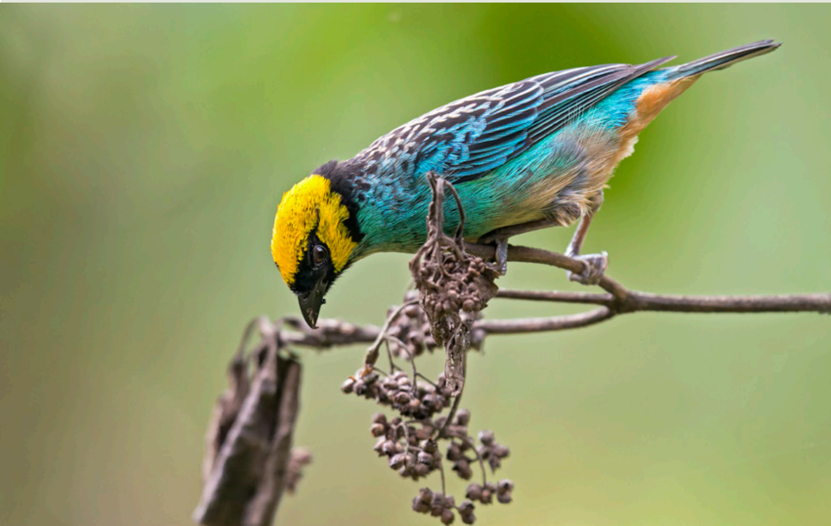
Saffron-crowned Tanager