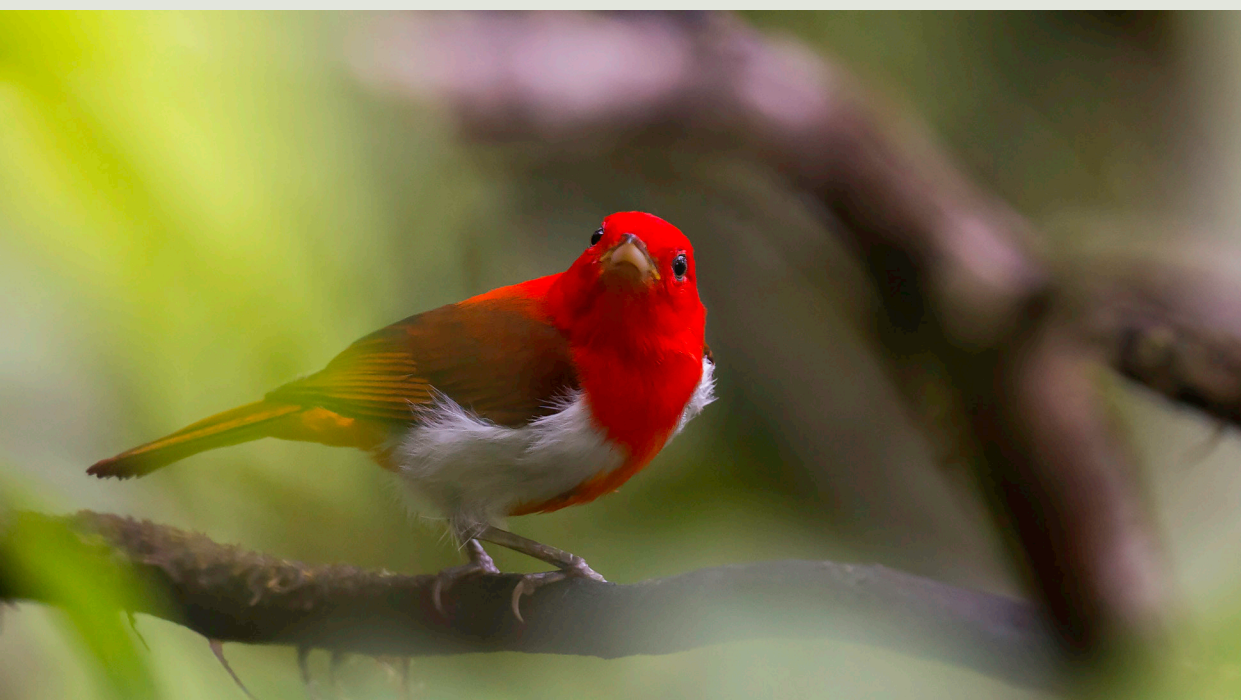
Scarlet-and-white Tanager