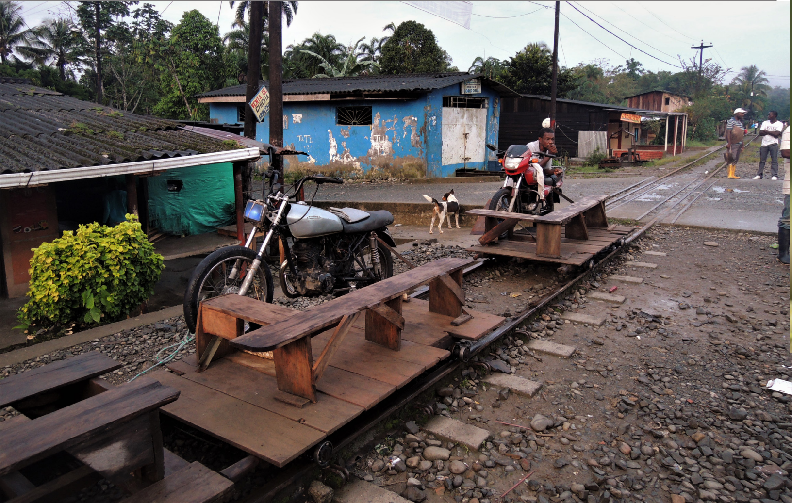
Brujitas in San Cipriano