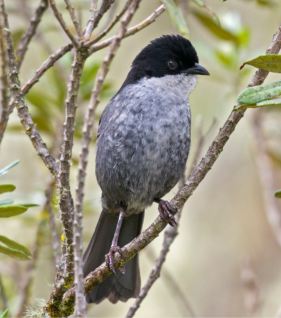
Black-backed Bush-tanager Juan Jose Arango

DAY 6 LOS NEVADOS NATIONAL PARK We will explore Los Nevados National Park, located on the highest part of the Colombian central Andes. We will wind through patches of forest that open up to Paramo, an ecosystem of tropical grasslands above the treeline, toward the picturesque 5,300-meter (17,400-foot) volcano Nevado del Ruiz. The scenery in Paramo is magical and surreal, with velvety Frailejon plants adding to this effect. Frailejon plants belong to the Espeletia genus and are endemic to Colombia, Venezuela, and Ecuador. The tour reaches elevations up to 3,950 meters (13,000 feet), so it will be cold. Here the goal is to find species adapted to high elevations like the endemic Buffy Helmetcrest and the near endemic Rainbow-bearded Thornbill, both of which sometimes forage on the ground. Also possible are Viridian Metaltail, Stout-billed Cinclodes, Brown-backed Chat-Tyrant, the beautiful Golden-crowned Tanager, near endemic Black-backed Bush-Tanager, and Glossy Flowerpiercer. We may also find a variety of seedeaters in the Paramo, including Plumbeous Sierra-Finch plus Paramo and Plain-colored seedeaters.