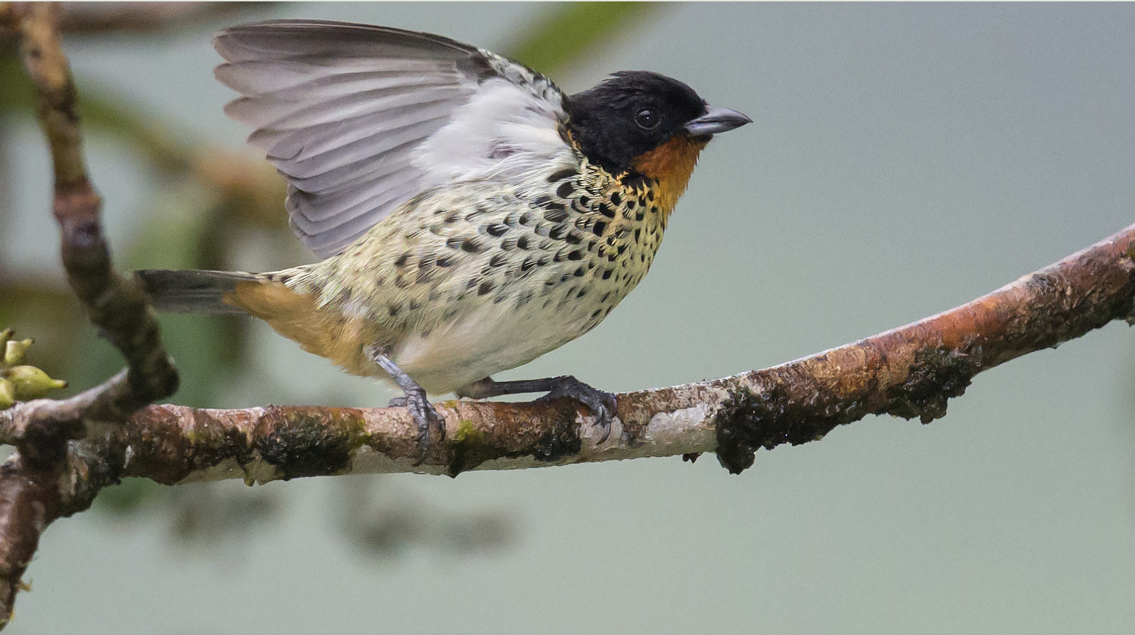
Rufous-throated Tanager