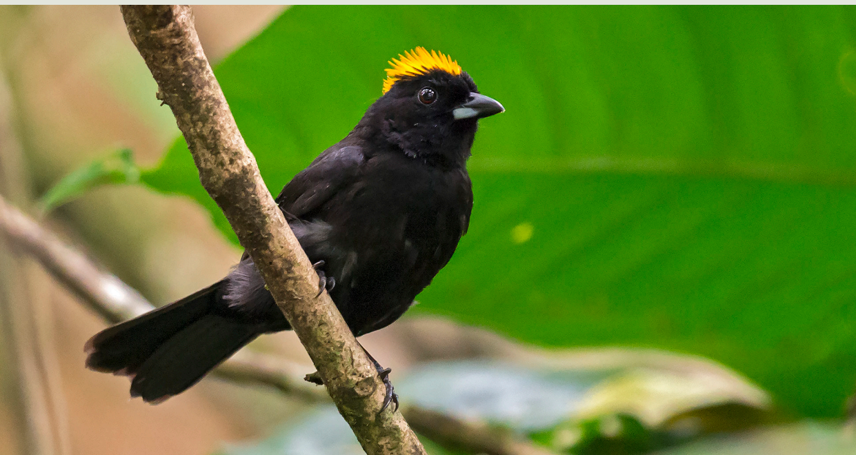
Tawny-crested Tanager