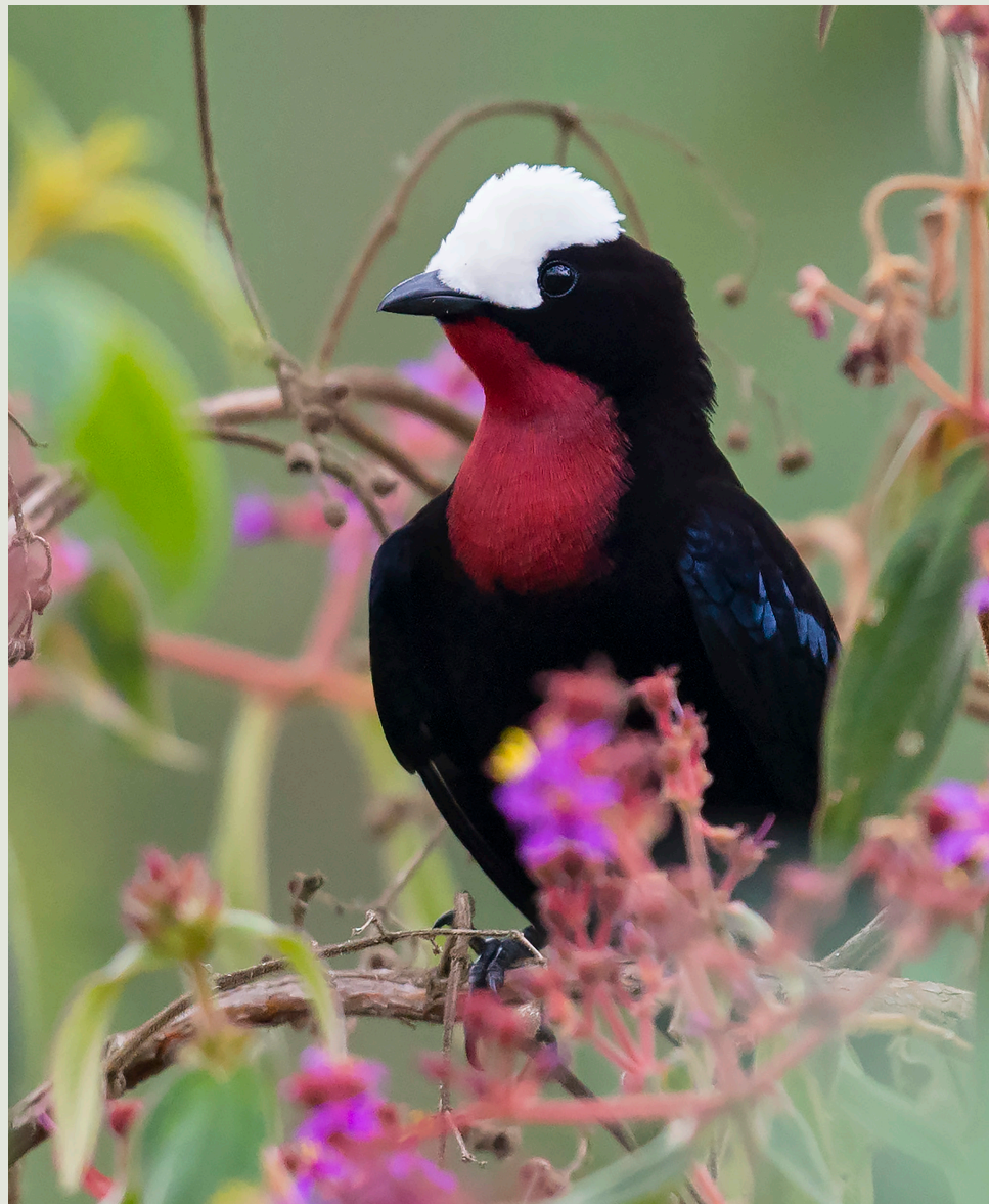
White -capped Tanager