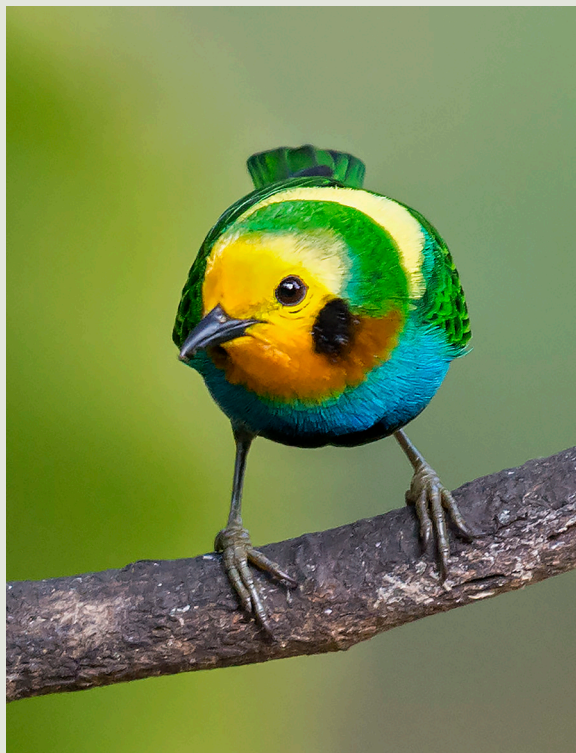
Multicolored Tanager