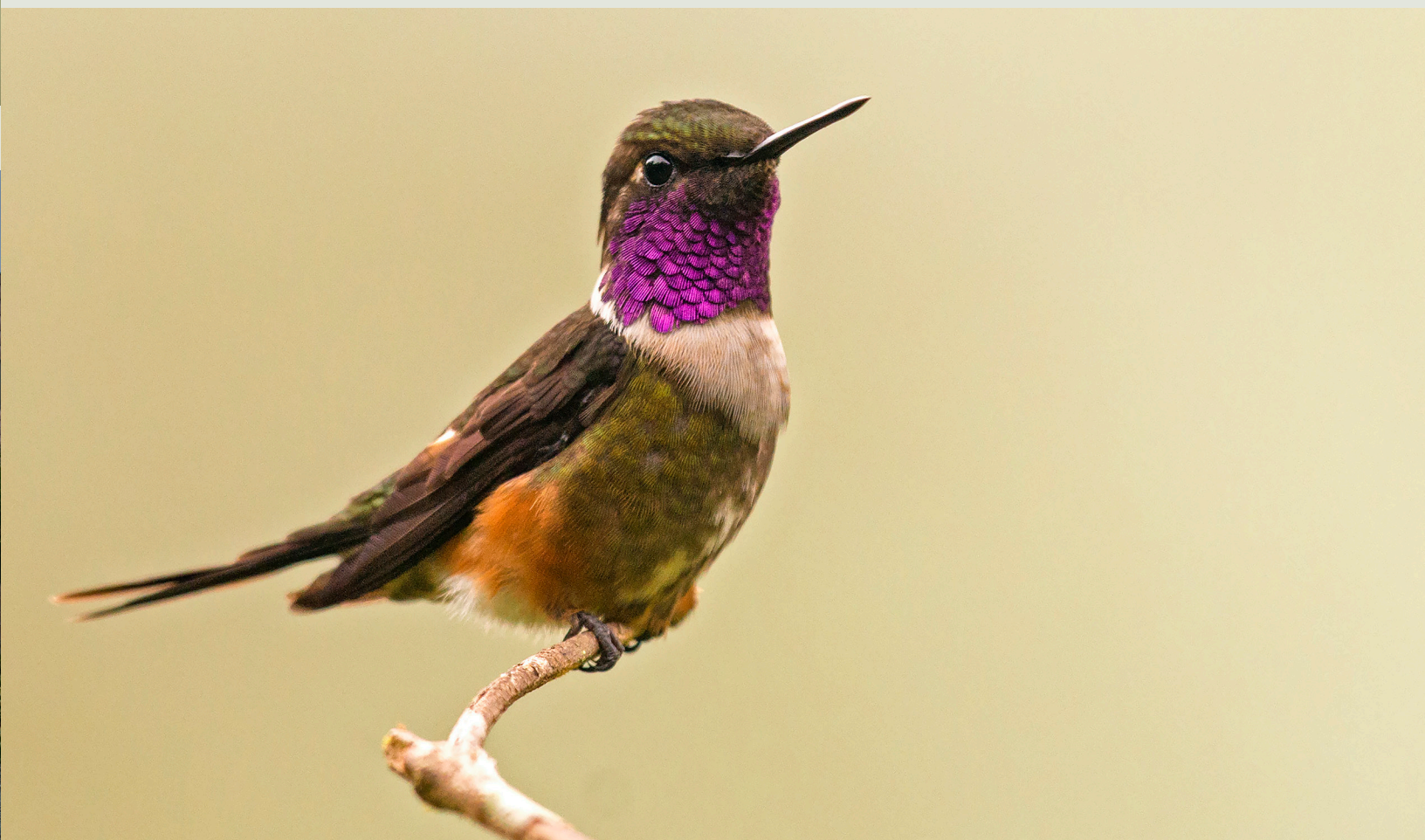
Purple-throated Woodstar