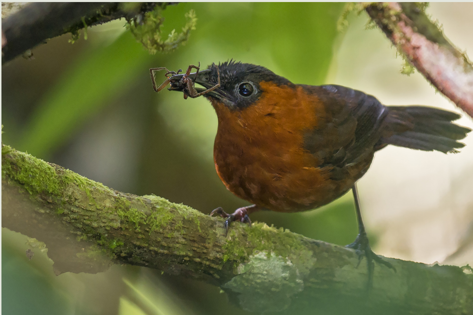
Chestnut-breasted Wren