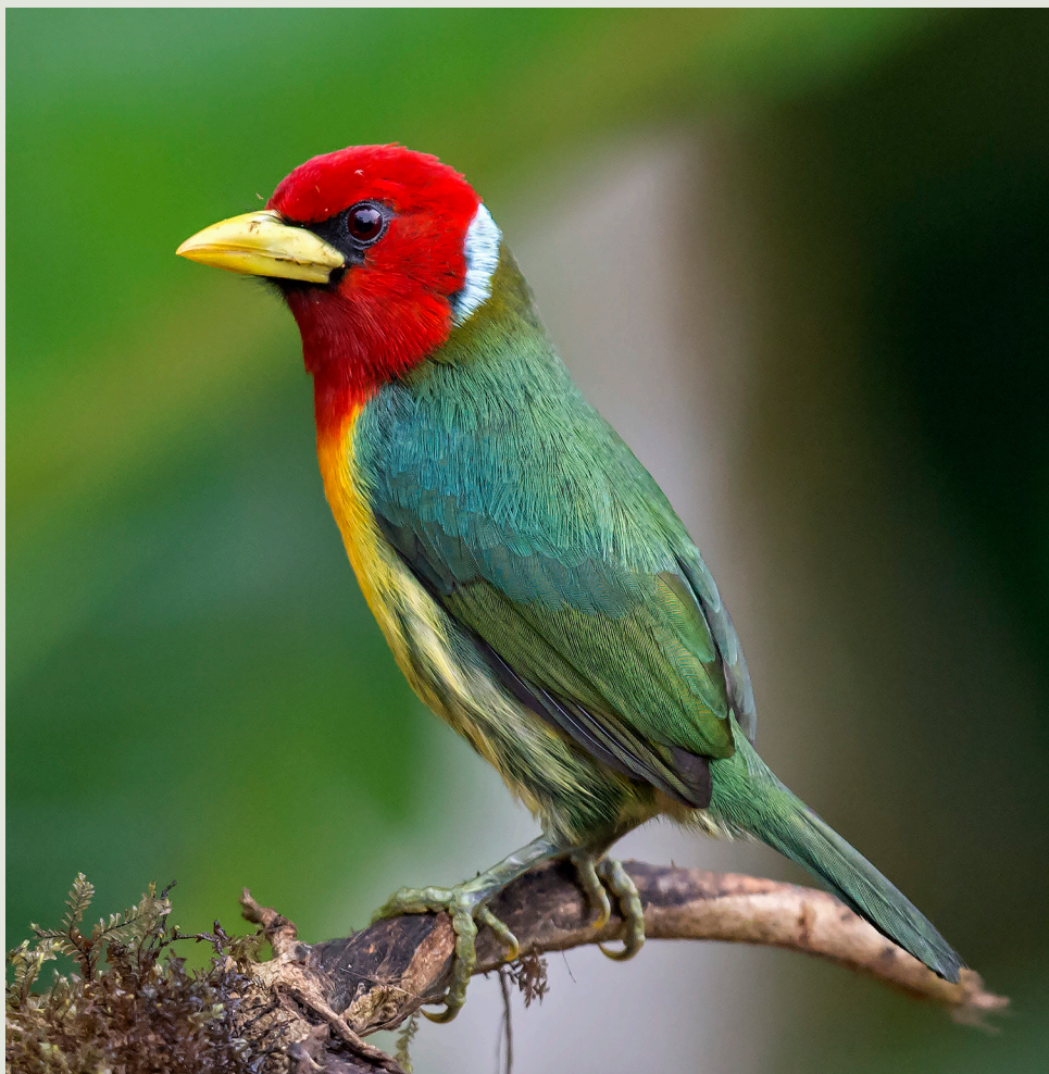
Red-headed Barbet