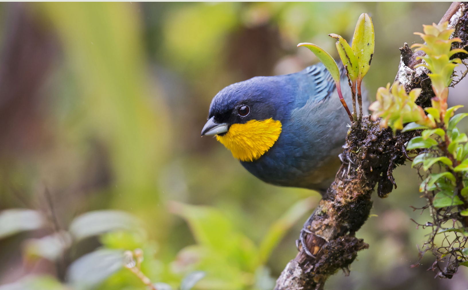
Purplish-mantled Tanager