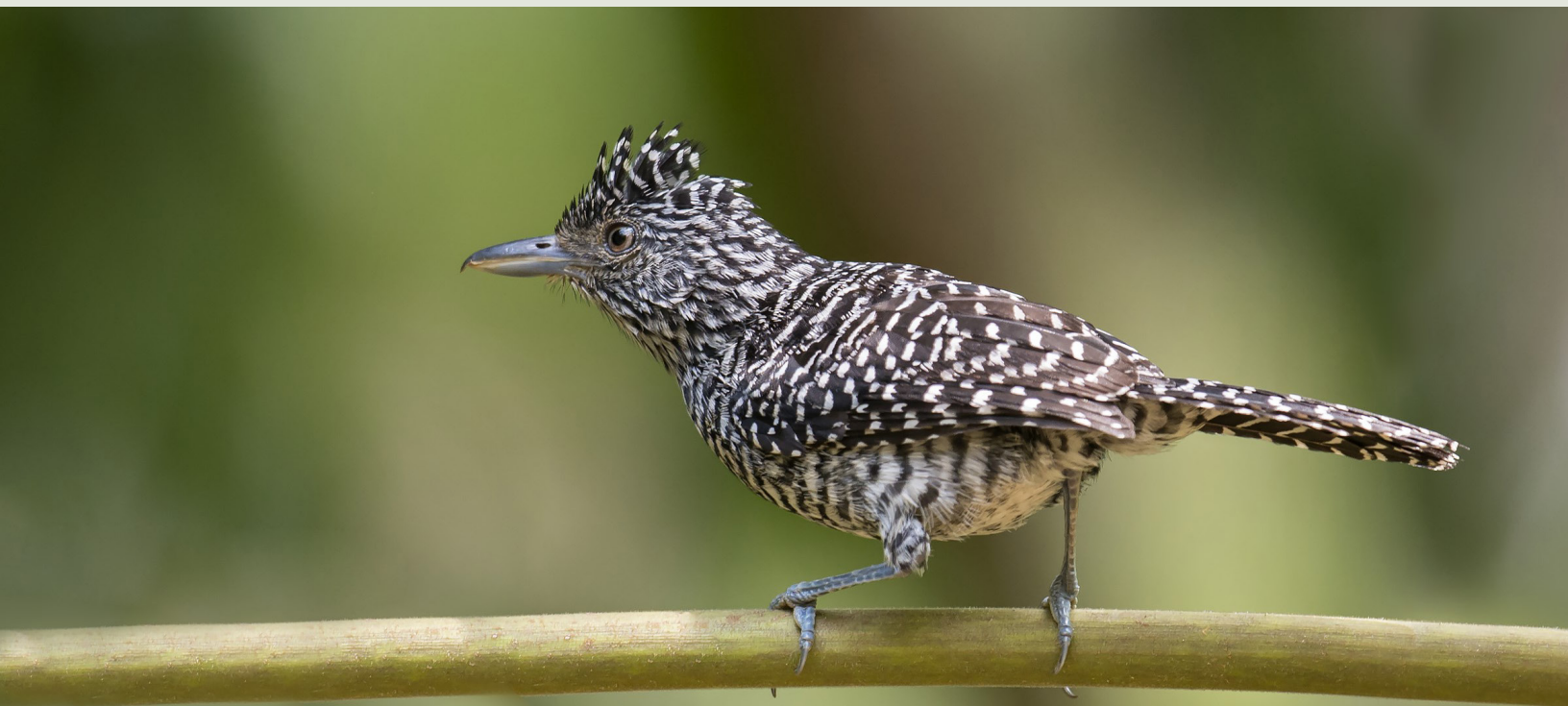
Bar-crested Antshrike