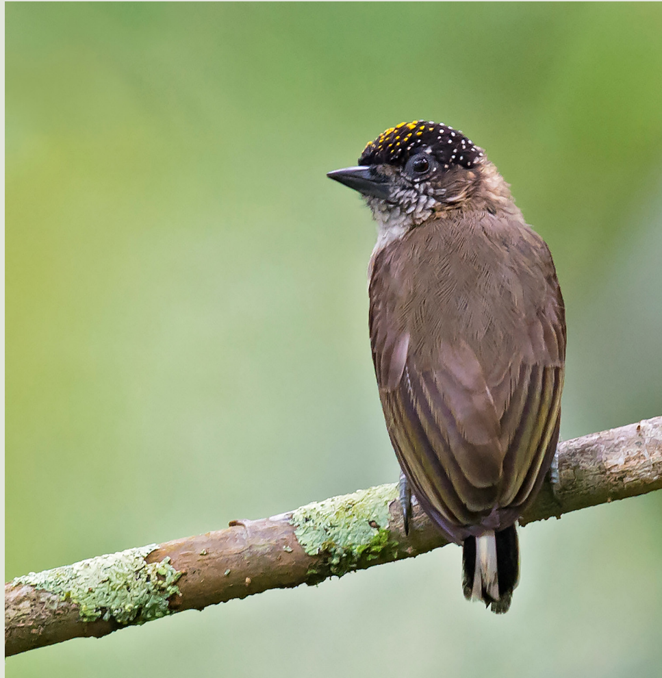
Grayish Piculet