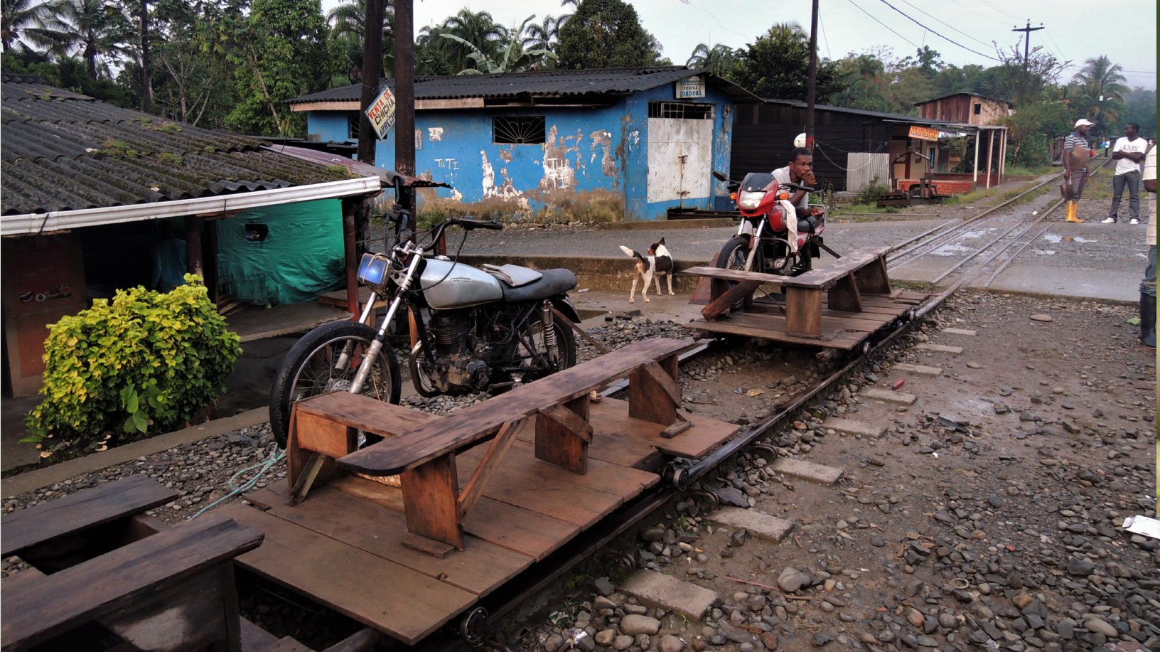
Brujitas in San Cipriano