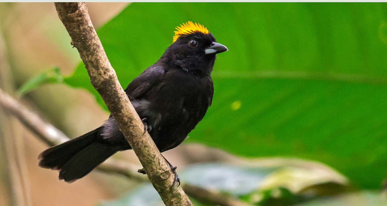
Tawny-crested Tanager