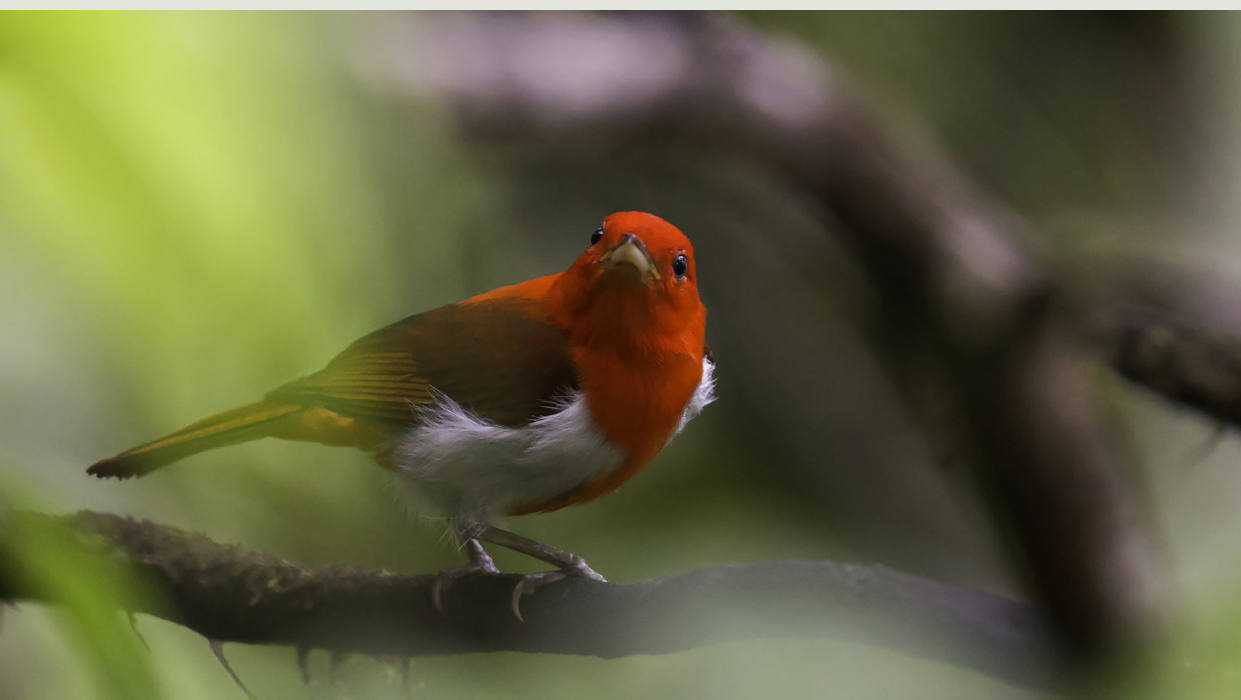
Scarlet-and-white Tanager