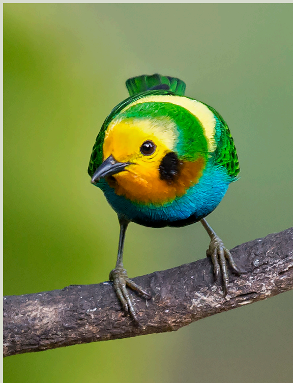
Multicolored Tanager