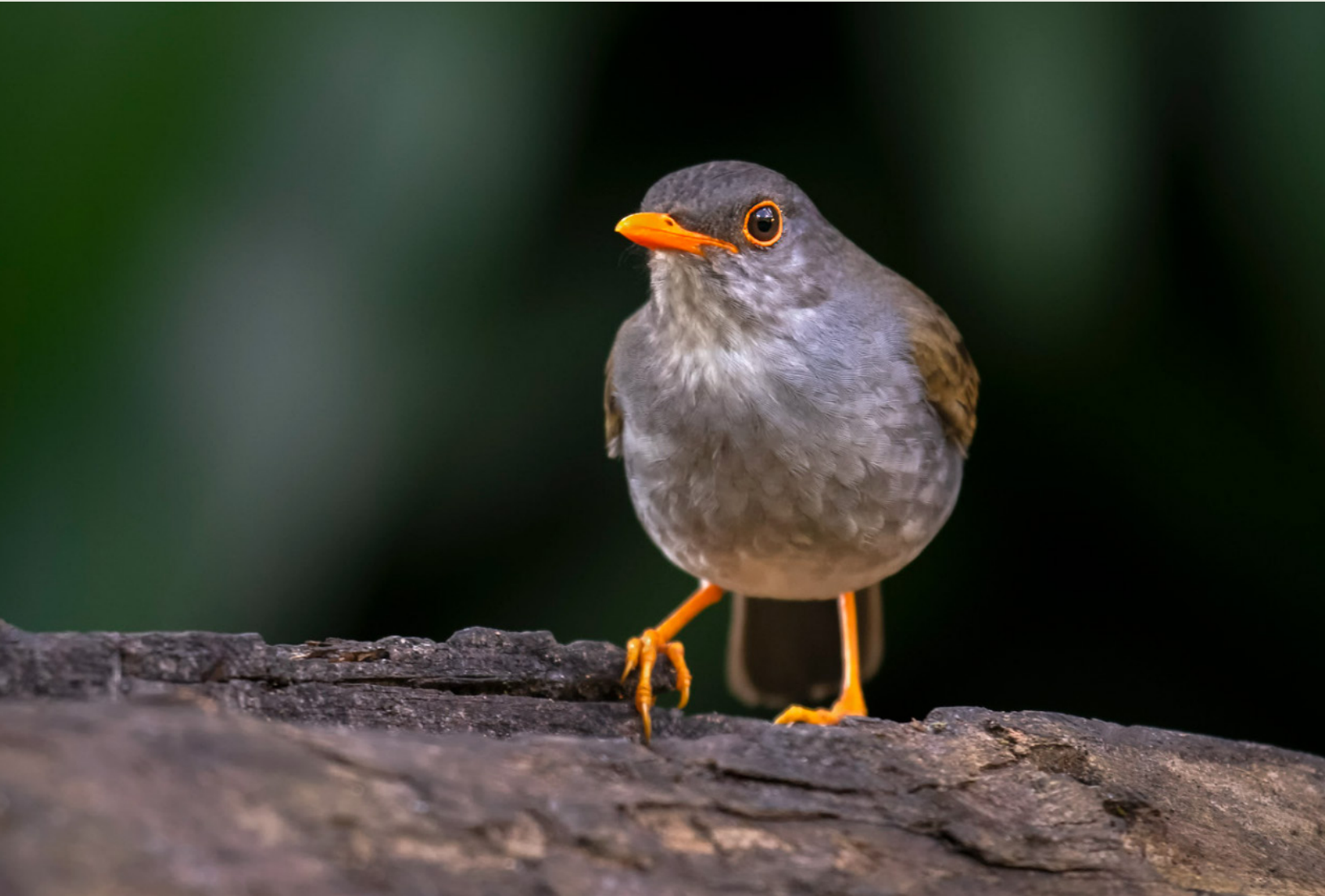
Orange-billed Nightingale Thrush