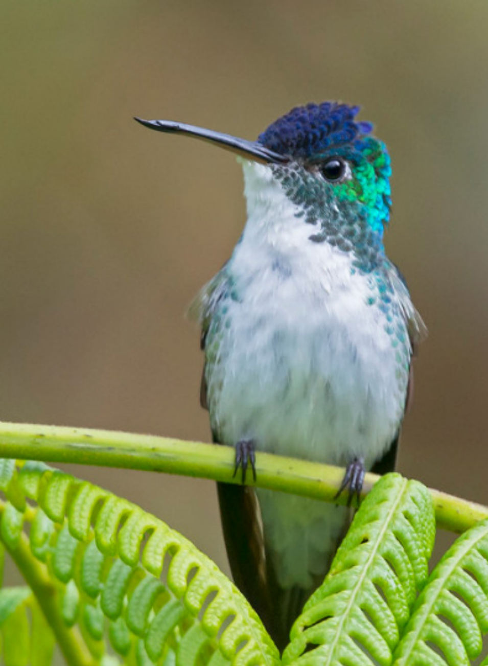
Andean Emerald