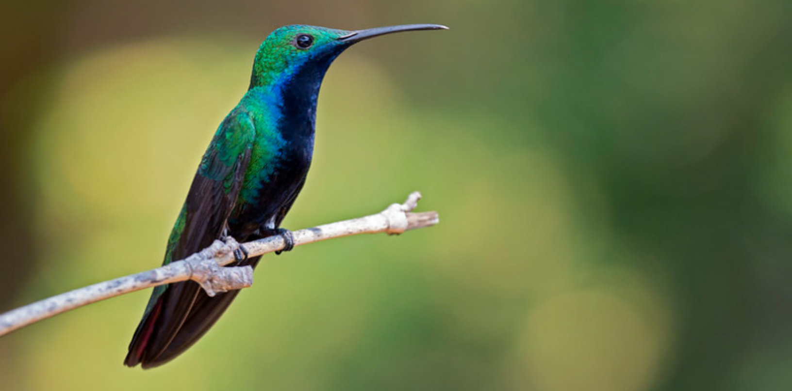
BLACK-THROATED MANGO AT ARAUCANA LODGE