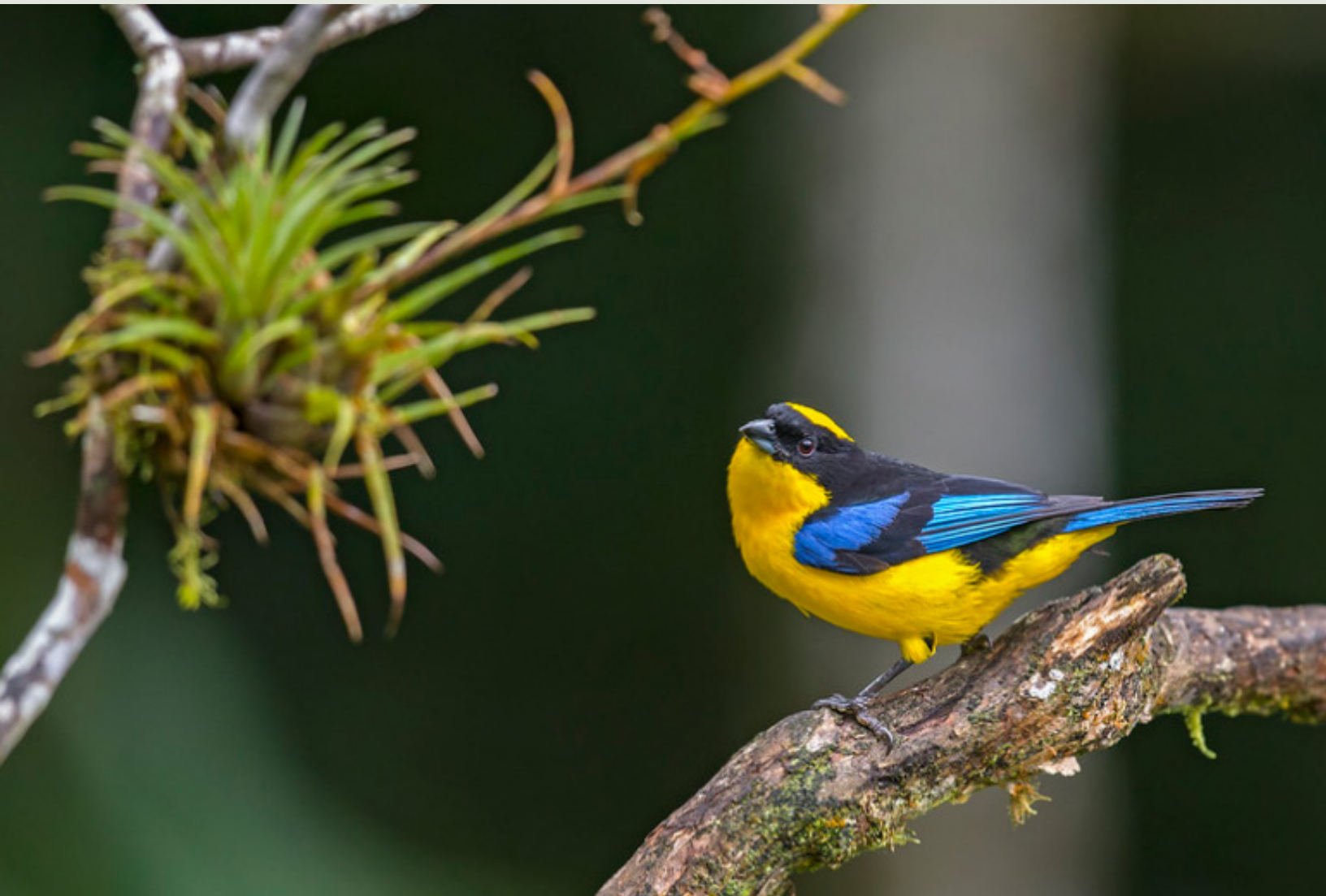
Blue-winged Mountain Tanager