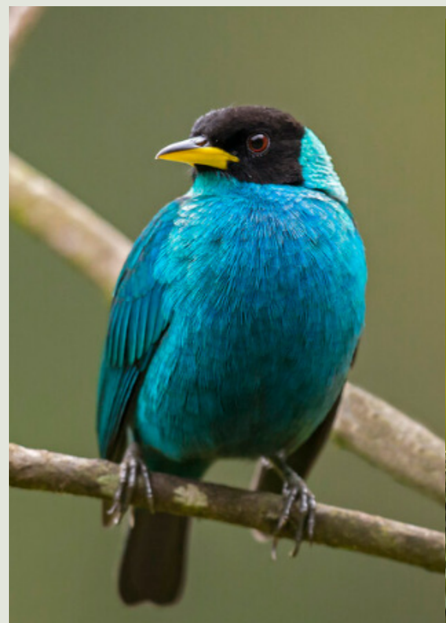
Green Honeycreeper Juan Jose Arango

In the surrounding forests your photographic targets will range from Scaled and Green-and-black Fruiteaters to Golden-headed and Crested Quetzals.